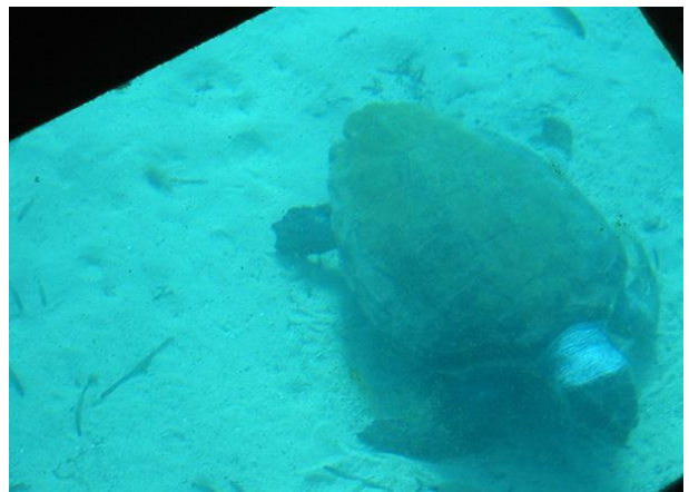
Glassbottom Yacht_ "Discovery"