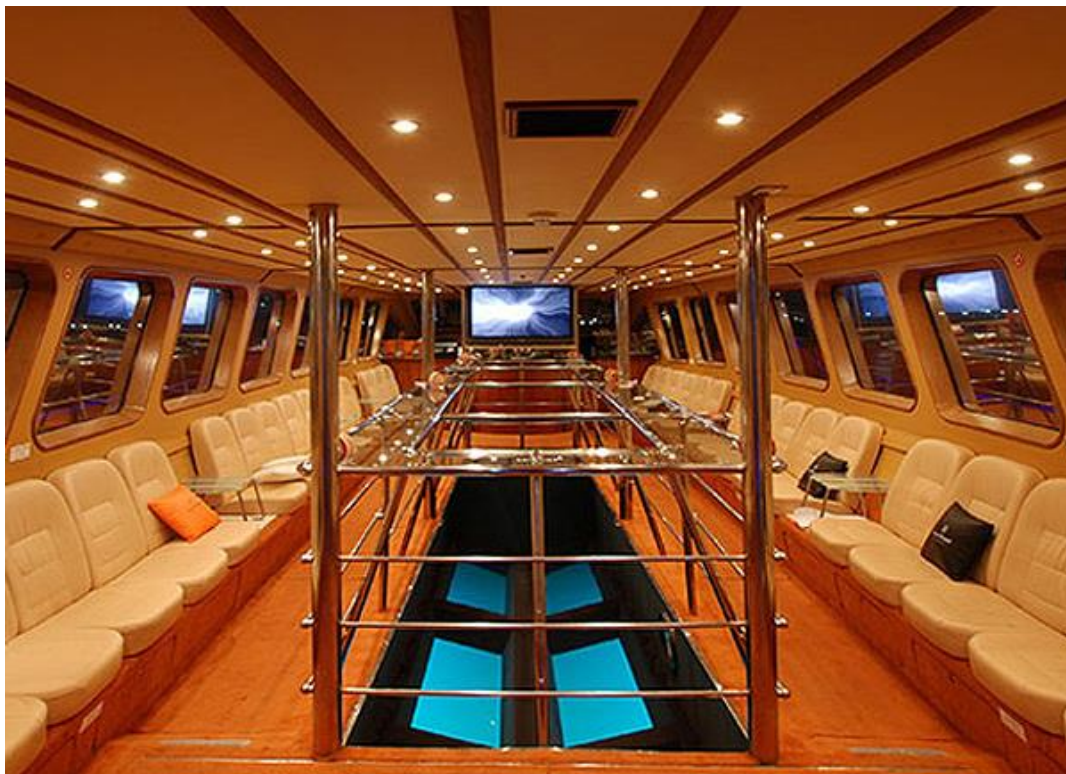
Glassbottom Yacht_ "Discovery"